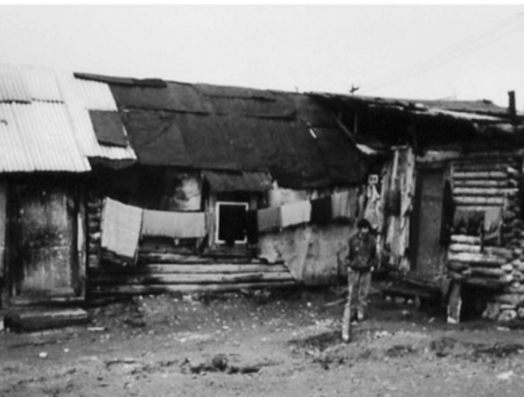
Typical conditions of the Roma settlements in Eastern Slovakia